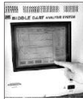
DART Stand Alone package, "SA" mounting option.