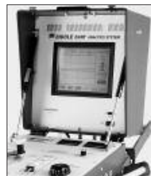
DART shown with "4K" mounting option.