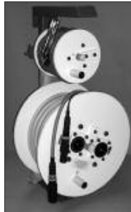
Optional 125 foot (38.1 m) high voltage/ground cable reel rack mounted assembly. Catalog No. CBL125RM

The CBL125 is a portable configuration, with the CBL125RM rack mounted assembly typically used for vehicle mounting applications. The CBL125 and CBL125RM use non-metallic reels rated to 32 kV.