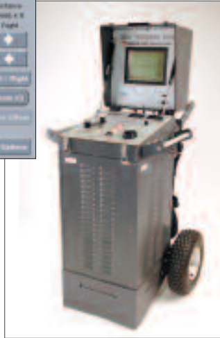
The PFL-4000 shown with the DART® Cable Analysis System and wheel kit