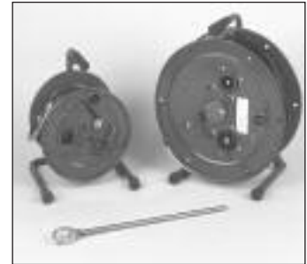
Optional 125 foot (38.1 m) high voltage/ground cable reel assemblies. Catalog No. CBL125